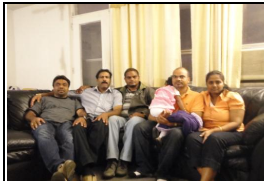
Get together with few JSSCP, Ooty alumni